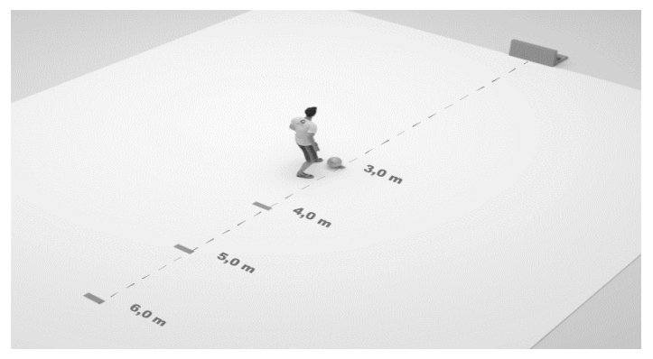
Figure 2. Closed context test to evaluate performance in the pass skill